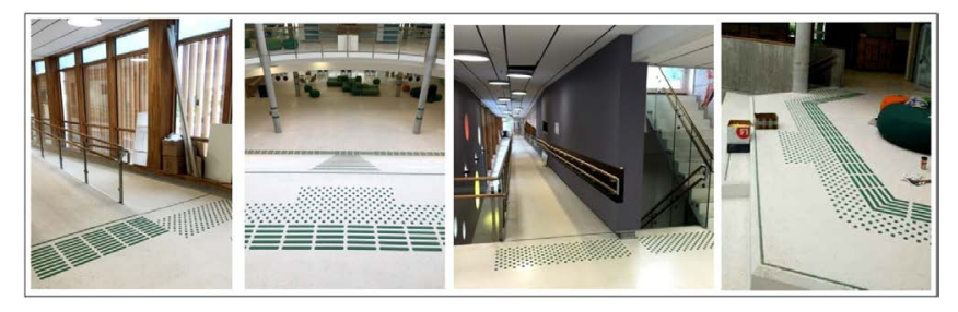
Figure 5. Bergen School

An example of solving the design of the school space in Bergen allows us to reveal the functional-utilitarian and aesthetic qualities of modern schools. The use of TacPro® stainless steel tactile tactile studs on the floor allows visually impaired students to move mobile and indicate the existing priority in choosing the desired direction. In this case, priority is given to professional modeling of the main passage zones and changes in the direction of movement along the perimeter of the architectural space. The tactile indicator message also meets modern aesthetic requirements and is both safe and convenient for school users. The above tools improve their intuitive perception by visually impaired children and promote mobile mobility;