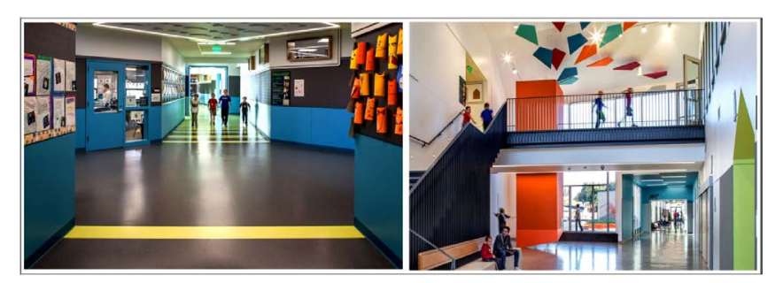
Figure 2. Lake Wilderness Elementary School

To determine the function of navigation in the formation of the design of the Peter G. Schmidt Elementary School (Tacoma, WA), the architects of TCF Architecture use the collage method. This method allows you to combine in one room several information accents, which are decided by the local type of their location: photos, text messages, active use of bright colors and embossed materials for fencing. First of all, we should pay attention to the definition of the principle of safety, which is one of the basic principles of universal design, proposed by architect Ron Mace. Therefore: