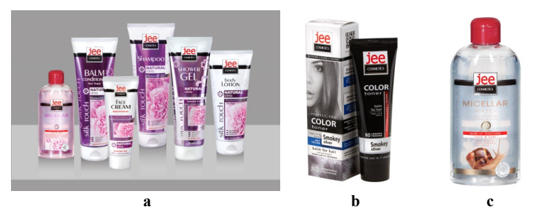
Figure 2 – Packaging design of the Ukrainian factory KOMBI: a – samples of products of the "Peony" series; b – toning balm; c – micellar water of the "Snail" series