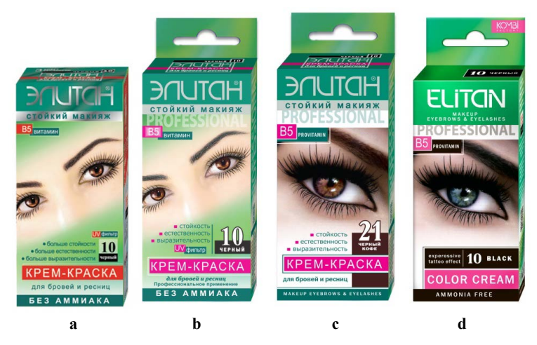
Figure 3 – Sample of redesign of eyebrow paint packaging of the Ukrainian factory KOMBI: a – 2010; b – 2013; c – 2018; d – 2021

this multidimensional series. Good packaging can easily inspire confidence and allow the brand to set product pricing y. Regardless of whether a new packaging design is being created or an existing design is being rebranded (Figure 3), there are basic principles that should be followed by a modern designer when designing packaging (Table 7).