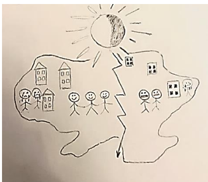
Fig. 1. Fem, 25, Rovenki, Luhans’k region, occupied

In case of Ukrainian community, it seems apparent that the cognitive map, which people and community is using to navigate interactions, encompasses exactly the physical map as of 1991 as a core symbol that “rhymes”. This is the moment where the heterogeneous collective image replication becomes the zone of conscious and subconscious visual influence that creates the environment of visual culture that conceptualizes the territory of Ukraine as a “non-negotiable” point for the community.