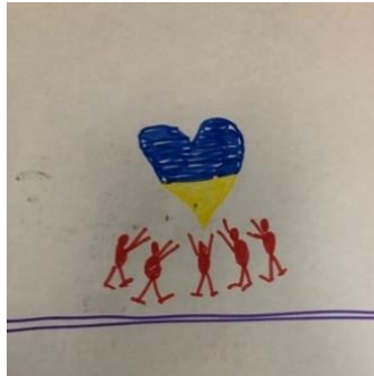
Fig. 9. Male, 20, Kharkiv, Eastern Ukraine