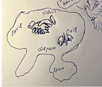
Fig. 8. Fem, 22, Mykolayiv, Southern Ukraine