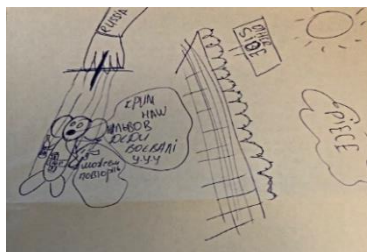
Fig. 6. Male, 20, Lviv, Western Ukraine