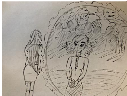
Fig. 4. Fem, 22, Poltava, Central Ukraine