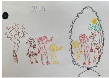
Fig. 3. Male, 35, Kropyvnytskyi, Central Ukraine

philosophy” presupposes the primacy of ethics from the experience of the encounter with the Other [4, p. 162]. Although many participants approached the assignment as a chance to demonstrate their own feelings and position in the conflict or impose guilt on the opposite party, some did show certain relational reflexivity in the process. As a result, a number of images visualizing mirror and self-reflection appeared. They picture a mirror as a demarcation border, where “the Other” is an exact or crooked reflection of “I”.