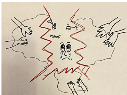
Fig. 2. Fem, 37, Poltava, Central Ukraine