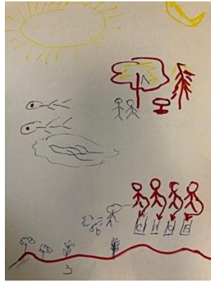
Fig. 7. Fem, 36, Dnipro, Central Ukraine